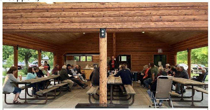
2023 Friends Annual Meeting

*Time to renew your 2024 membership if you haven't already! See the form on the back of this newsletter.